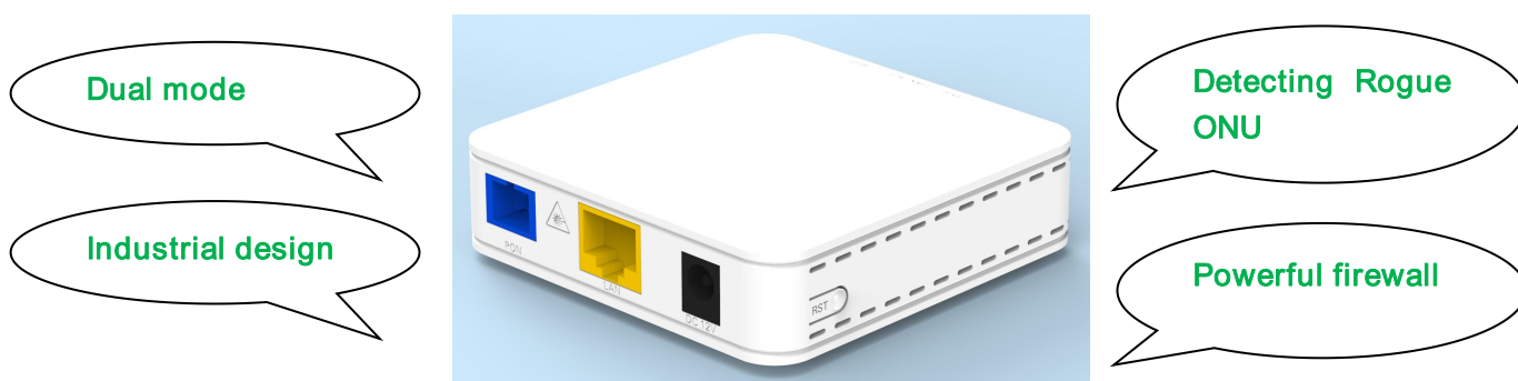
Figure 1 G/EPON 1GE ONU

ONT-1GE meets telecom operators FTTO (office), FTTD (Desk), FTTH(Home) broadband speed, SOHO broadband access, video surveillance and other requirements and design a GPON/EPON Gigabit Ethernet products. The box is based on the mature Gigabit GPON/EPON technology, highly reliable and easy to maintain, with guaranteed QOS for different service. And it is fully compliant with technical regulations such as ITU-T G.984.x and IEEE802.3ah.